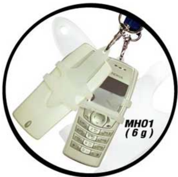
MH01 (6 g)