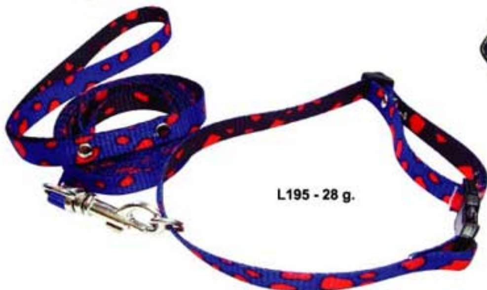
L195 - 28 g.