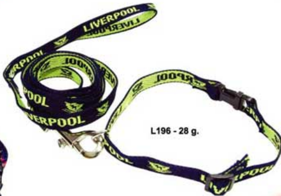
L196 - 28 g.