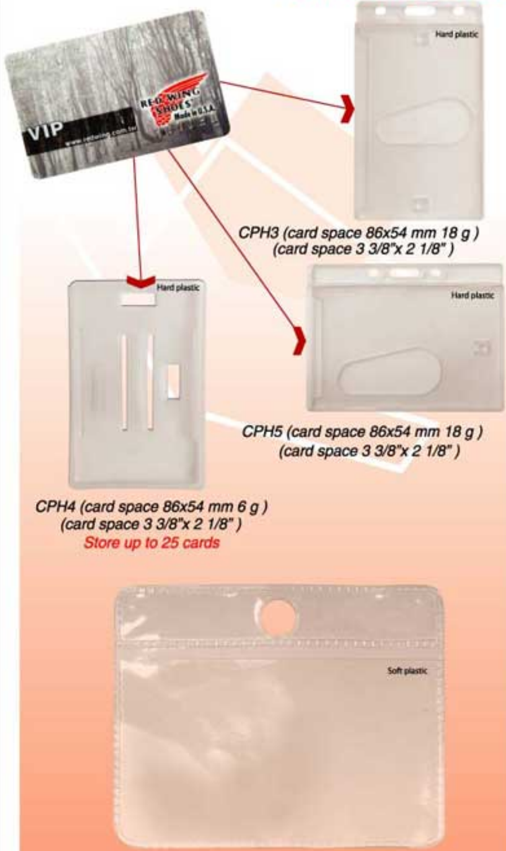
CPH3 (card space 86x54 mm 18 g) (card space 3 3/8"x 2 1/8")