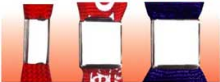
SQ10 (1 g)