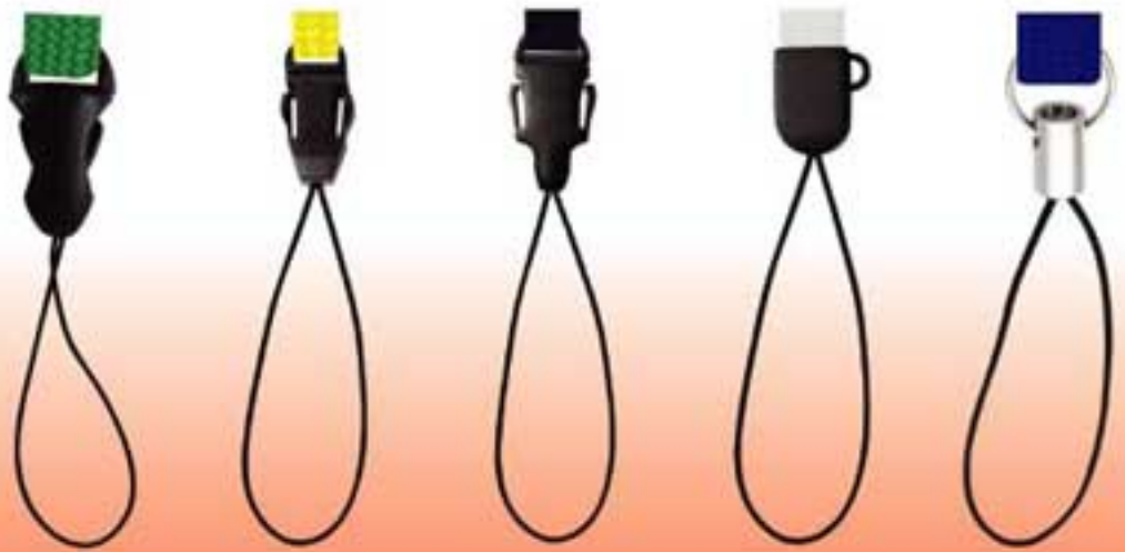
PMA10 (1 g)