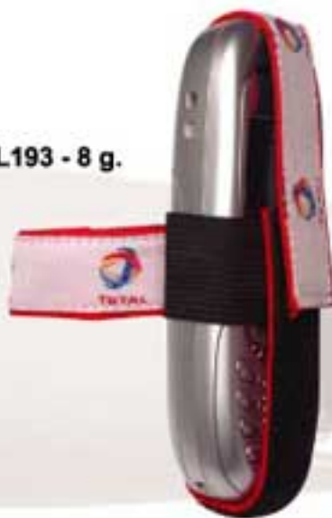
L193 - 8 g.