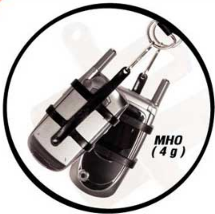
MHO (4 g)