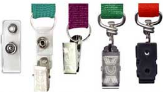
TP1D (2 g)